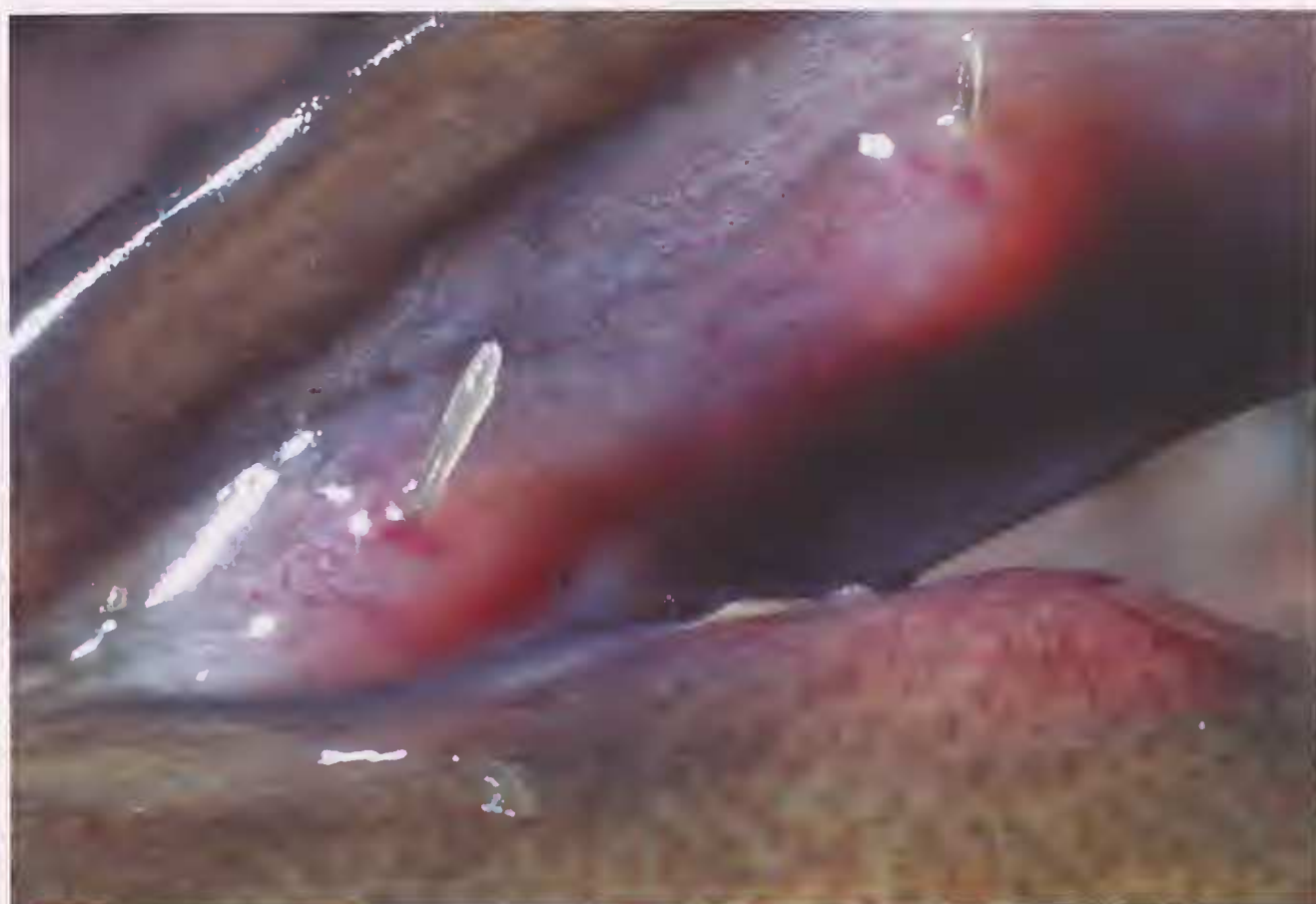
Figure 2. Ulcerated lesions at the site of attachment of female anchor worms to a freshwater cobbler ( Tandanus bostocki ) host.

freshwater cobbler, Tandanus bostocki Whitley) and three introduced fish species (goldfish, Carassius auratus L.; eastern mosquitofish, Gambusia holbrooki (Girard); and one-spot livebearer, Phalloceros caudimaculatus (Hensel)) were infested at the two localities. Prevalences differed between fish species, with the native species G. occidentalis and E. vittata being most heavily infested (Table 2). For these two species, infested fish tended to be